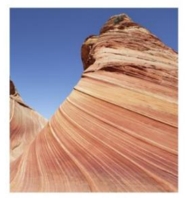
Tales and Dovels Volume 6